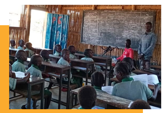
Children in class at IDP Camp in Juba South Sudan

refugees. This collaboration among nonstate actors with the government, operating under the Comprehensive Refugees Response Framework (CRRF), has formulated various plans and engaged diverse stakeholders to enhance access to services for both host communities and refugees, thus ultimately promoting social cohesion.